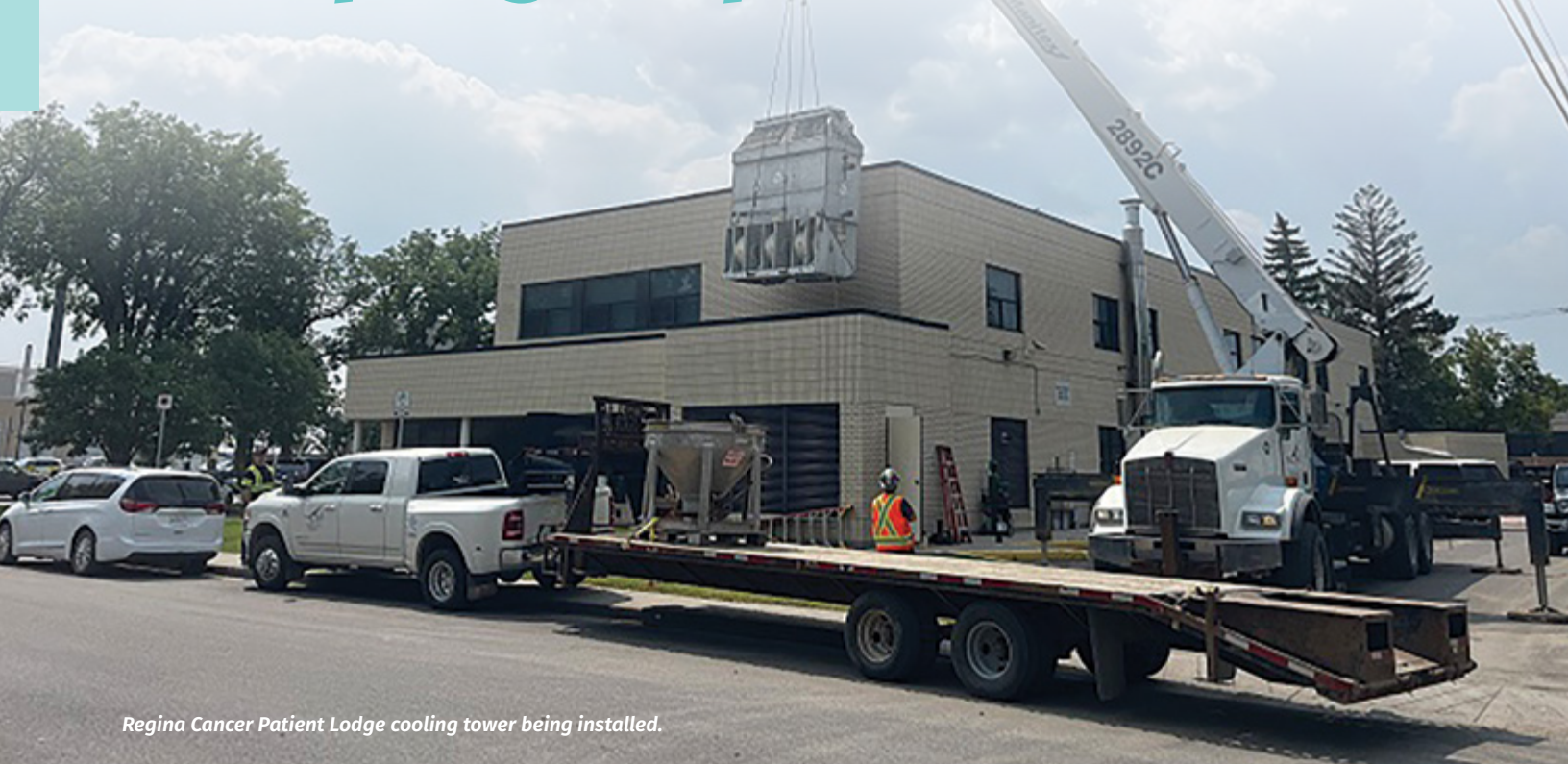
Regina Cancer Patient Lodge cooling tower being installed.