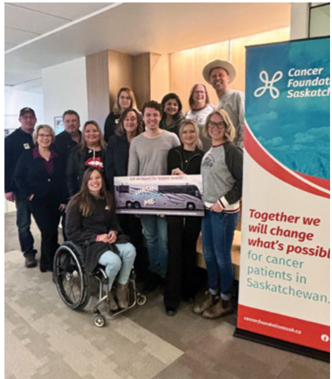
The cast of the 2024 TeleMiracle visits the Cancer Foundation to learn about the Breast Screening Bus.

Thanks to the generosity of the Kinsmen Foundation and their TeleMiracle donors, equitable access to breast screening mammograms will continue to be a priority.